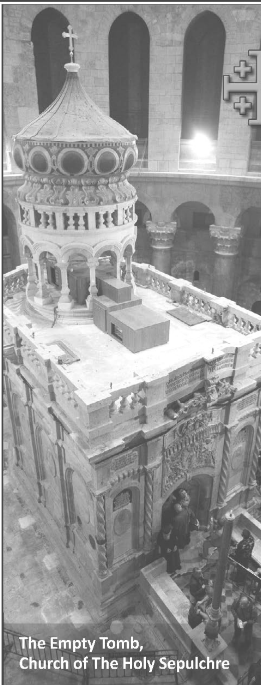
The Empty Tomb, Church of The Holy Sepulchre