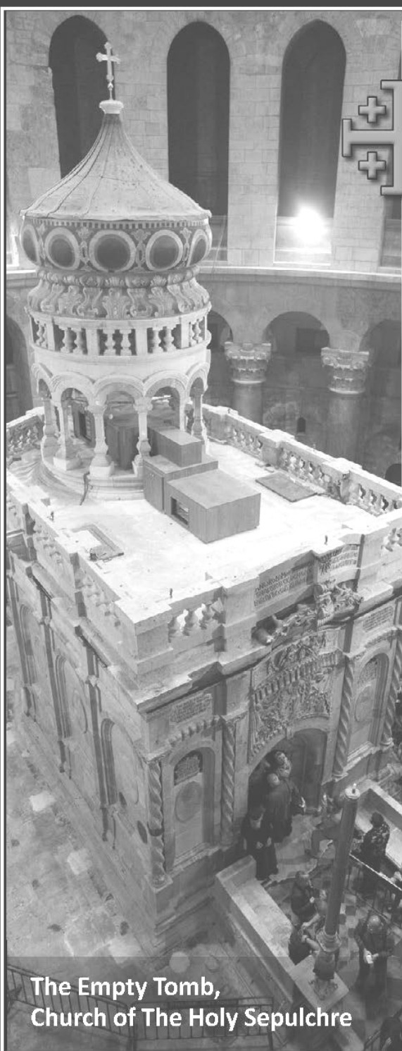
The Empty Tomb, Church of The Holy Sepulchre