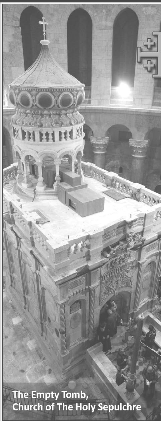
The Empty Tomb, Church of The Holy Sepulchre