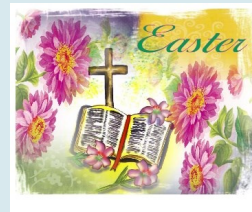
This Photo by Un-

EASTER IS RIGHT AROUND THE CORNER So come to the Corner Shoppe to purchase gifts and cards to celebrate this special season!